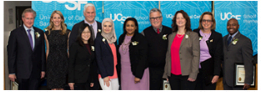
Founders Day Awards Honor Public Service, Staff Contributions