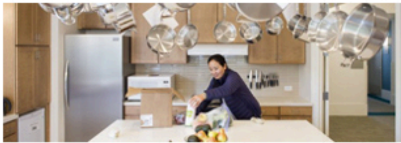
New Family House Opens at Mission Bay