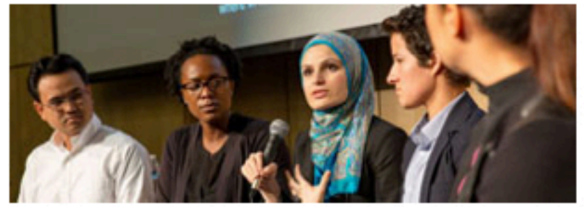
Teach-In with Soledad O'Brien Spurs Dialogue About Injustice