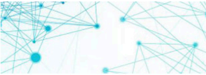
Computing for the Cure: Finding Cancer's Hidden Weaknesses