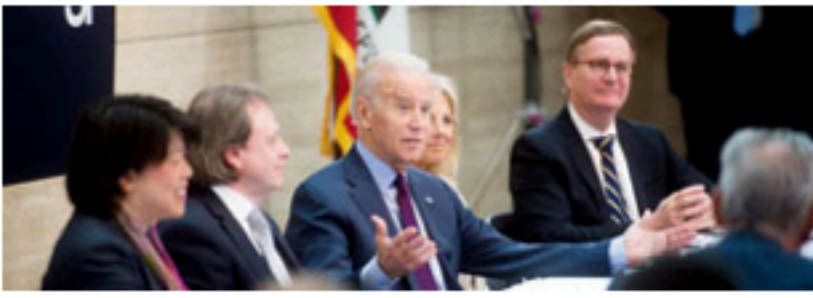
Joe Biden Visits UCSF to Speak About Cancer Moonshot

Essential news for the UCSF community. For more, visit pulse.ucsf.edu »