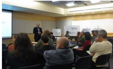
December 11 2008 community meeting

At the November meeting, questions and concerns were raised about helicopter operations and related noise impacts as well as elements of the proposed RSRP. UCSF staff responded to these concerns and addressed specific questions at the December meeting. Specific changes made to the proposed RSRP as a direct result of neighbor input are: