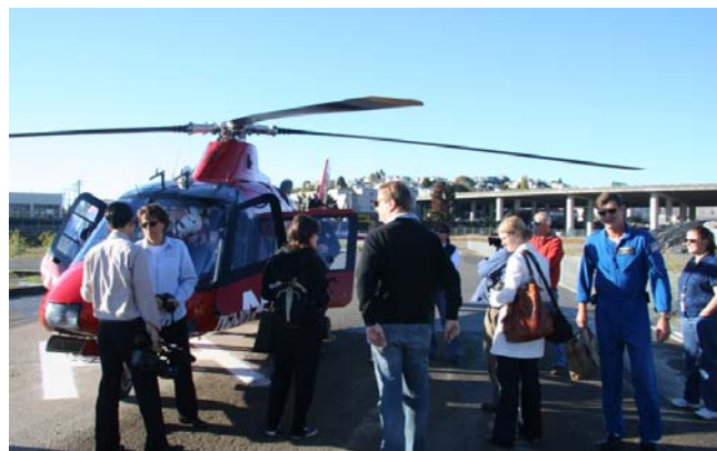
Helicopter Test Flight, October 21, 2007

The community has been involved in the hospital planning process since 2001—UCSF has conducted more than 60 meetings involving community members. To date, UCSF Medical Center has incorporated a number of significant design changes in direct response to community feedback. Additionally, on October 21 2007, UCSF conducted a helicopter flight test which was planned in concert with Mission Bay neighbors, and met with neighbors to share test results.