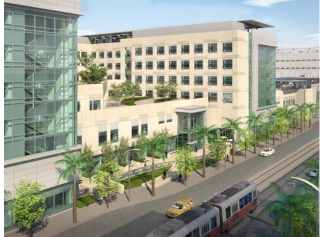
Inpatient Buildings and Plaza on Third Street

The UCSF Medical Center at Mission Bay , an integrated hospital complex that will serve children, women, and cancer patients, is scheduled to open in 2014. The hospital site is located just south of the existing UCSF research campus (bounded by Mariposa, 16th, 3rd, and the future Owens Street). Comprised of 289 inpatient beds and outpatient services , the medical center will include a children's hospital , women's specialty hospital , and a hospital for cancer patients . For more information about the UCSF Medical Center at Mission Bay, please see Appendix A: Facts about UCSF Medical Center at Mission Bay .