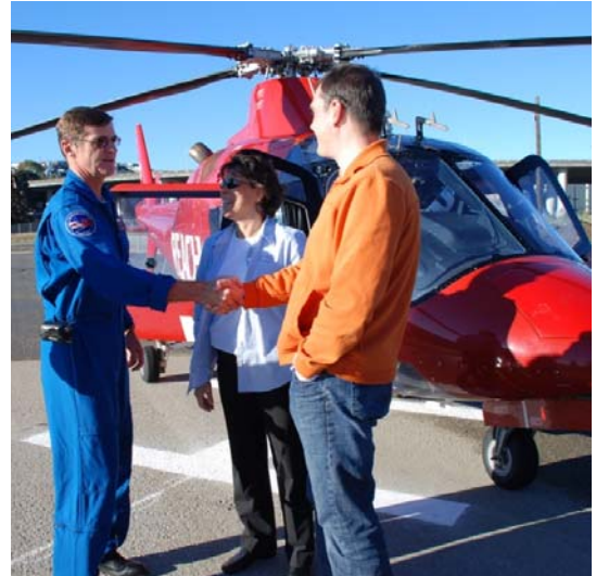
A helicopter flight test was conducted in partnership with Mission Bay neighbors in October 2007.