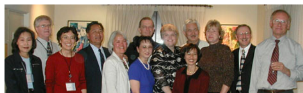
1972 Class Members

who today oversees chemical research at one of the larger pharmaceutical companies in the world. Or that once quiet classmate whom today is a renowned speaker and travels throughout the US giving presentations on the treatment of hypertension.